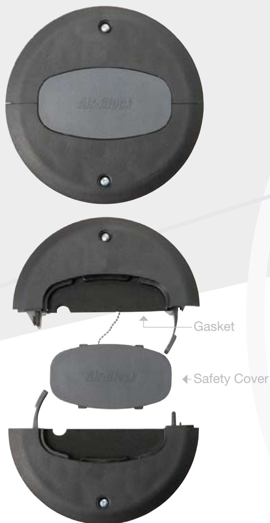
Air Block™ Separated