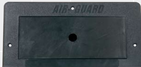
Air Guard® Flush Mount with Safety Cover